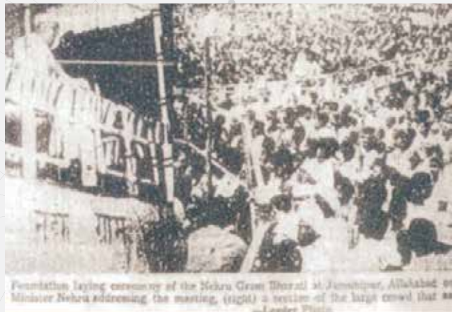
Late Pt. Jawahar Lal Nehru laying the foundation stone of Nehru Gram Bharati on 26th July, 1962