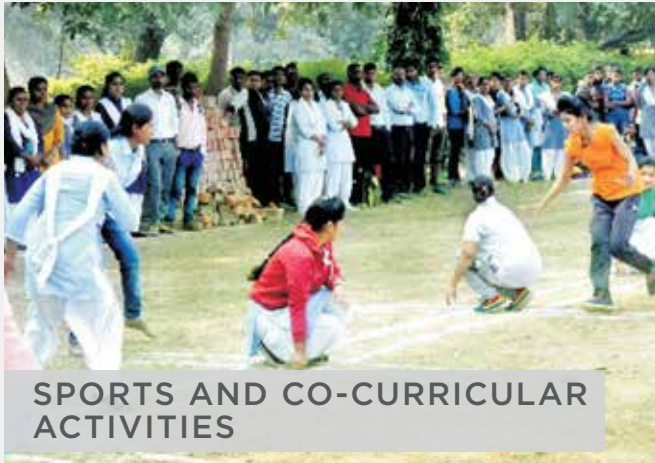
SPORTS AND CO-CURRICULAR ACTIVITIES