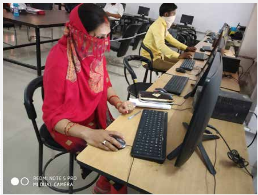
REDMI NOTE 5 PRO MI DUAL CAMERA